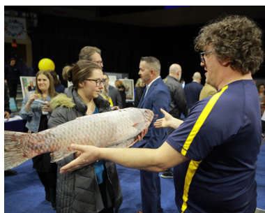
The UToledo Grass Carp Strike Team brought a frozen carp for their display.