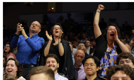
Special thanks to all of the family and friends who support our Rockets throughout their college experience.