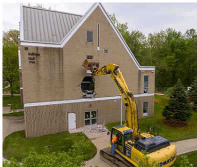
An excavator begins the demolition of the exterior of the academic office building Sullivan Hall.

In early May, demolition began on Academic House, International House and the Sullivan Hall office building. Klumm Brothers are heading the demolition project estimated at $2 million. It is expected to be completed by the beginning of fall semester, with students returning to greenspace where the buildings are currently located along West Rocket Drive.