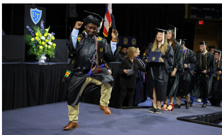
All May 2025 graduates receive a complimentary one-year membership to the Alumni Association.