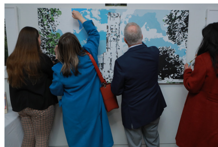
An oversized paint-by-number of University Hall offered a fun activity for attendees.

Donor Celebration is one of the Foundation's favorite moments to express our heartfelt thank-you to the individuals whose generosity drives innovation, scholarships and academic excellence across campus.