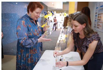
A Cosmetic Science and Formulation Design student walks through her interactive display.