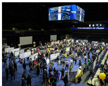
Hundreds gathered for the research celebration on April 2.