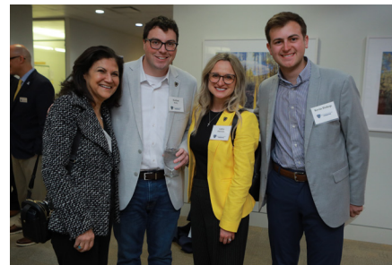
The evening was a time to reconnect, celebrate all we have accomplished and look to the future.