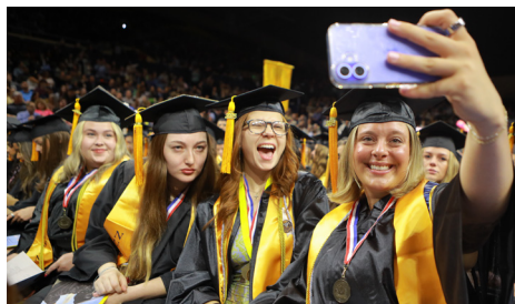
All four selfie-taking Rockets graduated with bachelor of science in nursing degrees.

"The most memorable thing for me about UToledo is getting to go through all the chaos of nursing school with the best cohort I could have ever asked for. I'm so thankful for every single one of them and I know I have made some true friends for life," he said. "Nursing school is hard, but nursing is the most rewarding and fulfilling career. I can't see myself doing anything else."