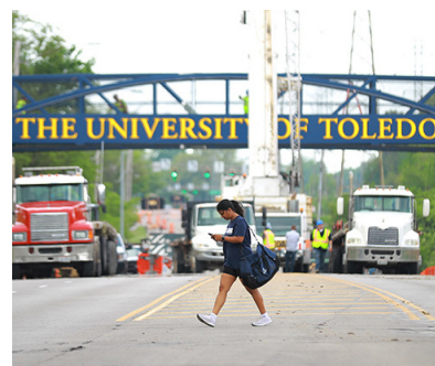
A pedestrian crosses the closed section of Douglas Road after the bridge was securely anchored in place.

It is exciting to see the continued support and investment in our campuses as we enter a new chapter of growth, improvement and innovation.